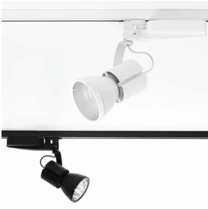
GULM SPOT Dimensions