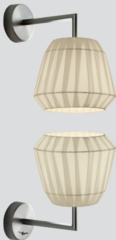
LOTEAP016P01 / LOTEAP016P02

— Applique in plissé fasciato a mano. Secondo le versioni, pannello di finitura inferiore in plexiglass opale.