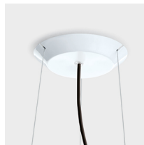
Icaro Ball 90 canopy detail