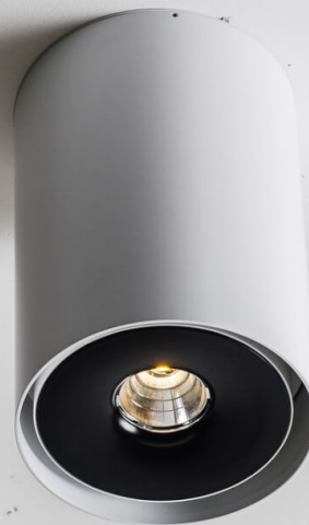
White & Black