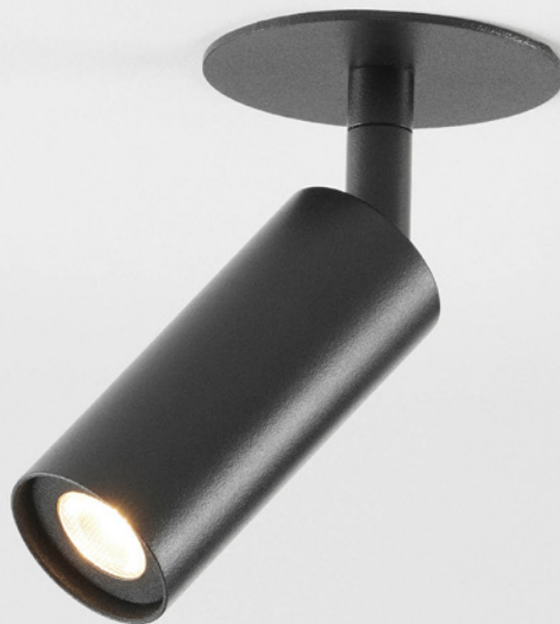
VIS C1S - 6 cm (2.36'')