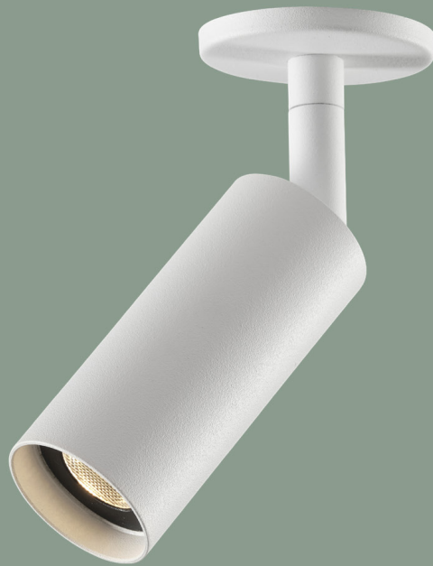
VIS C1S - 4.5 cm (1.77'')